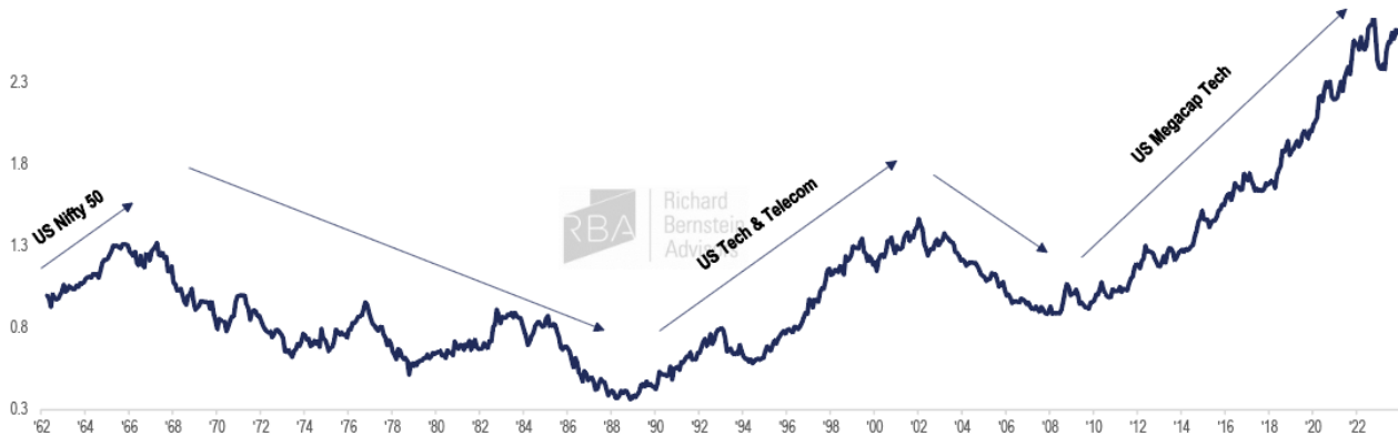
Chart 5: S&P 500® vs. International Developed Markets relative total return index ratio

Note: International developed market stock performance prior to 1970 is based on local currency monthly price returns weighted as follows: UK FTSE All-Share Index (40%); Germany DAX Index (15%); Japan Topix Index (15%); Australia ASX All Ordinaries Index (15%); Canada S&P/Toronto Stock Exchange Composite Index (15%). For comparability, we also use S&P 500® price returns prior to 1970. From 1970, all returns are based on total returns in USD, with international developed market returns based on the MSCI EAFE index.