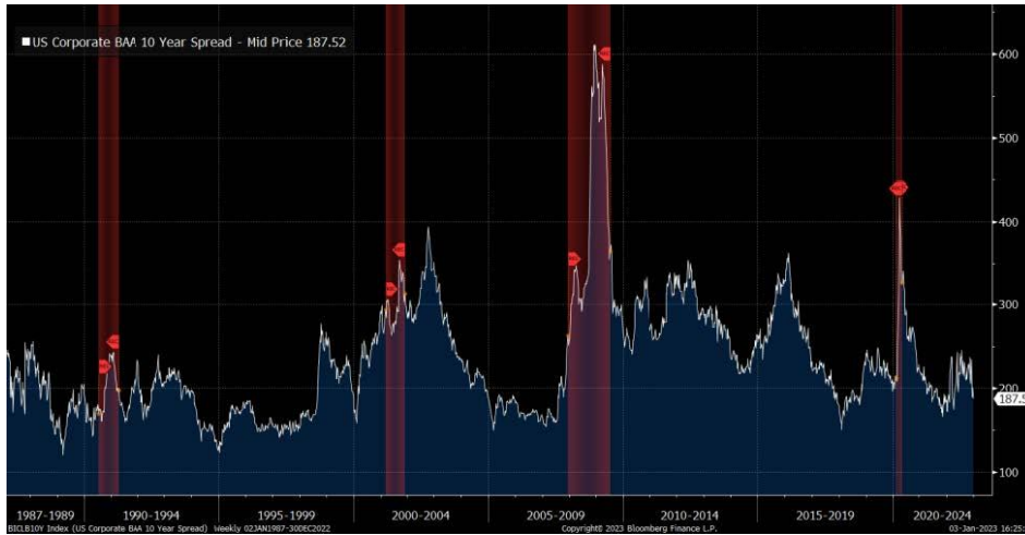
Chart 1: US Corporate BAA 10-Year Bond Spread (Jan. 1987 – Dec. 2022)

Investment discussions continue to highlight a false dilemma of growth vs. cyclicals and omit the third option of defensive sectors despite their consistent history of outperforming during profits recessions. There are two main inputs to equity valuation: 1) earnings and 2) interest rates. Investors have so far seemed to focus on #2 (the Fed and interest rates) and relatively ignore #1 (earnings). The US, and many other countries, are in the early stages of profits recessions, yet both equity and fixed-income markets have been very slow to anticipate the potential falloff in corporate profits. The chart below shows corporate bond spreads through time. Although spreads have widened a bit in anticipation of corporate cash flows coming under pressure and an increasing probably of default or bankruptcy, the spread remains very low relative to historical recession periods.